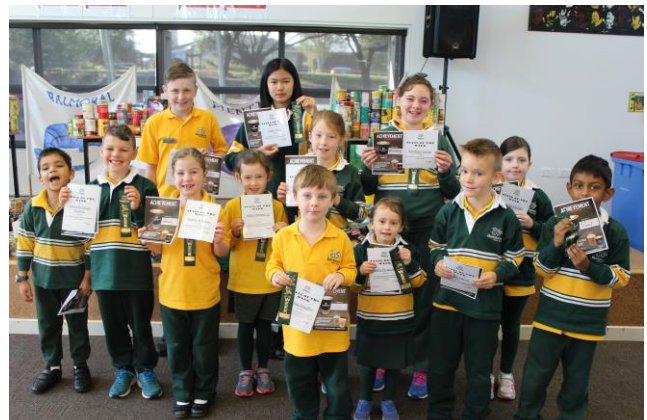
Congratulations to our Pupils of the Week!