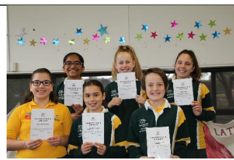
Special Principal's Awards!