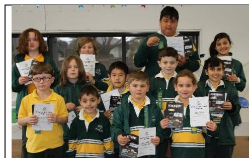
Pupil of the Week!